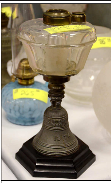
Centennial Bell Hoyt Font