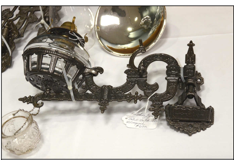
Bracket Lamp: Hook-On Font Holder, Match-Holder Bracket