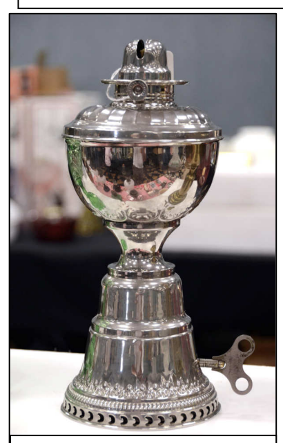
Hitchcock Side-Wound Lamp