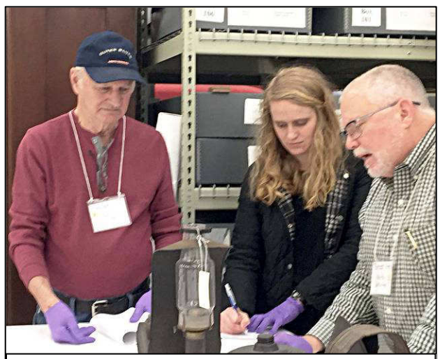
Club Members Help Identify Lighting at the Historic Arkansas Museum Storage Facility

successful in merging luxury and comfort with the 140+ year old building's large and quiet rooms. The hotel's large elevator is rumored to have been built to allow Ulysses S. Grant to take his horse to his room. A free trolley with numerous stops around the downtown area provided a convenient way to explore the city and to visit some of the local attractions.