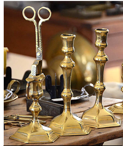
Brass Candlesticks and Matching Snuffer Holder

The meeting began with lunch at noon, followed by a Show and Tell session. Nearly everyone brought items to show. Caroline Jacobsen talked about a pair of candlesticks and the difficulty of finding a snuffer that would fit a matching brass holder. Chuck Leib gave a talk on the “save-all”, a thrifty little form of candle holder that allows the candle to be burned until fully consumed. He displayed a number of examples, (photos shown below), and provided illustrations, patent information and anecdotes showing the use of the save-all in 18 th century satire.