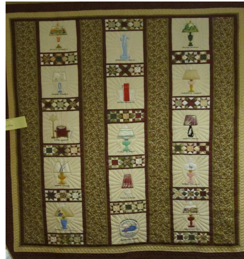
Aladdin Raffle Quilt for 2016