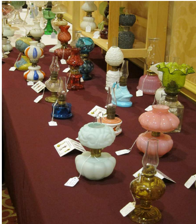
Miniature lamps for sale at the show

The seminars started early on Friday morning and went on all day. Bob Culver of the Night Light Club gave an interesting talk on new ways to identify miniature