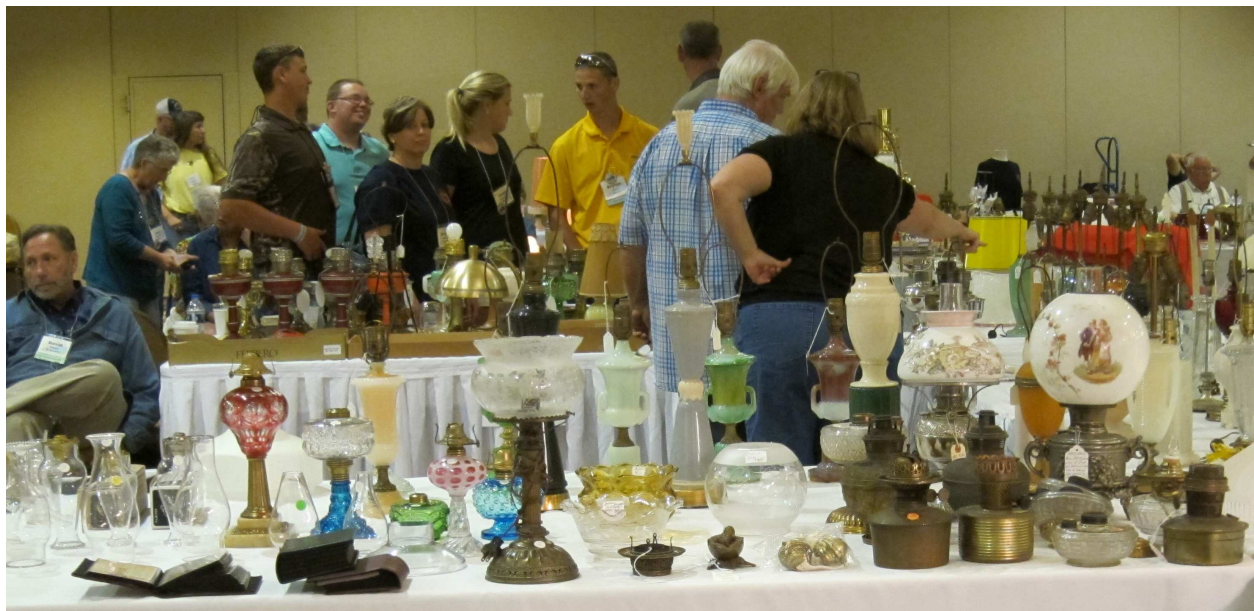
Eager buyers at the opening of the Lamp Show

The 45 th Gathering in 2017 will be in Columbia MO, August 6 th - 13 th .